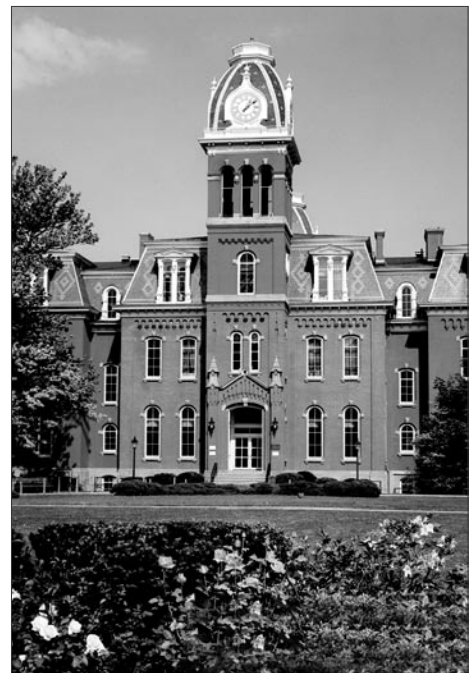
Woodburn Hall at WVU