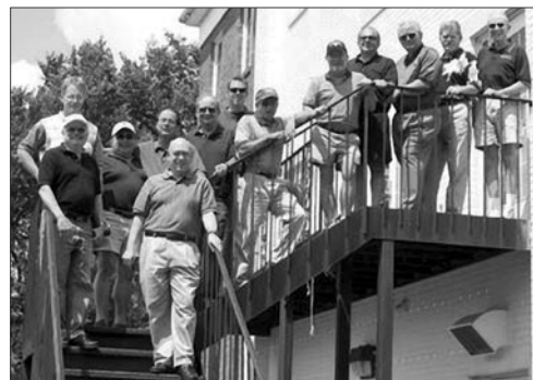
Right: 2004 Alumni Gathering in Morgantown.

Planning on attending a home football game? If so, check out our website at www.wvupikes.com for details on tailgate locations and times.