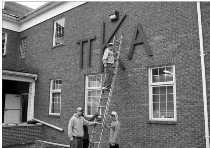
Members placing Pike letters on House.