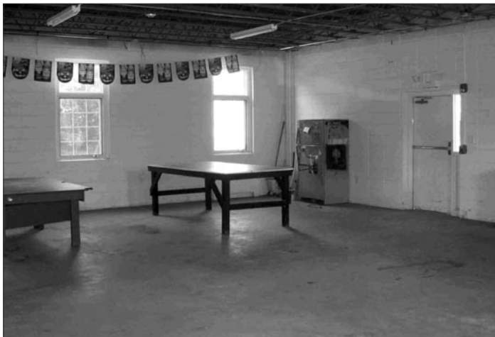
Above: Library “before”. Below: Library “after”.

Thanks to a handful of alumni, the House Company and hard working undergraduate brothers, a portion of the Pike House at 117 Belmar Avenue has been refurbished. Most recently, the “library” has been turned into an area where brothers can congregate informally or hold small more-formal gatherings. With a budget of $5,000 from alumni donations, Alpha Theta was able to create a functional space that is enjoyed by many. Thank you to all who made this possible.